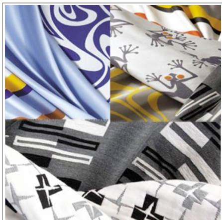
The new Alaxi fabric collection IMPROV, featuring bold hues, playful patterns and geometric shapes.

Silver State has launched a new spring Aláxi fabrics collection, IMPROV, offering superior performance in Sunbrella acrylic with a patterned touch of whimsy and grace.